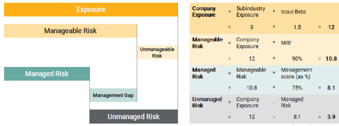
Exhibit 1: Risk Decomposition

Below exhibit illustrates how the unmanaged risk of a material ESG risk factor is computed: